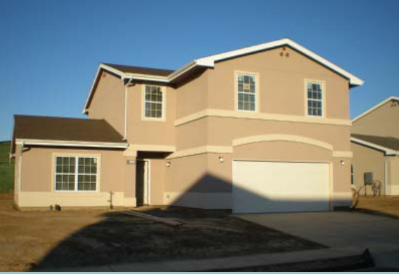
Travis Air Force Base California