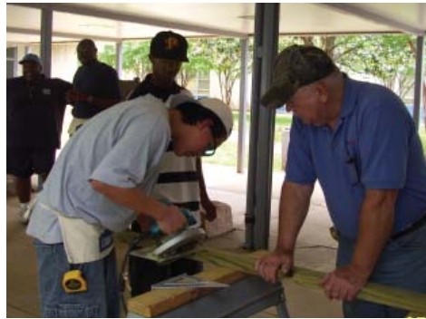
Students are introduced to the industry with some hands on demonstrations

RT Dooley joins the Communities in Schools program to prepare students for graduation