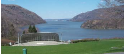
Historic Hudson River

In 1841, Charles Dickens visited West Point and said of the academy "It could not stand on more appropriate ground and any ground more beautiful can hardly be." More than 150 years later, Balfour Beatty Construction is walking that same ground, providing new housing for the academy that has helped write American history since the days of the Revolutionary War.