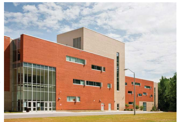
Cary High School

Balfour Beatty went beyond providing a positive experience and a quality product with no major set-backs (a welcome change for the WCPSS in its own right). The team completed the project nearly three months ahead of schedule and returned $1.1 million to the WCPSS. It was the first time Wake County had ever received money back from a contractor at the end of a project. For a school system that's expected to serve more than 20,000 students by the 2010-2011 school year, every penny counts, and with Balfour Beatty at the helm, the school got much more than they ever expected.