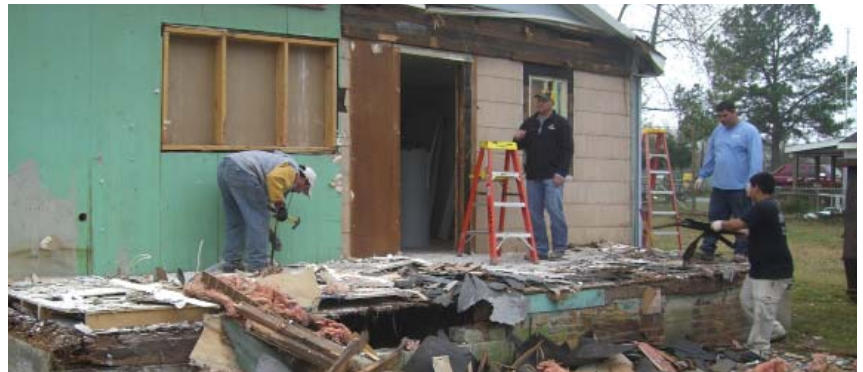
The team gets their hands dirty as they help demolish the backside of a house slated to be Johnston County's Special Olympics main office

Balfour Beatty's NC Museum of Art team pitches in to help the Johnston County Special Olympics